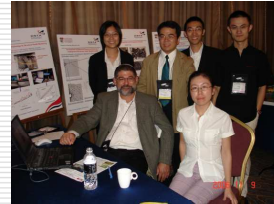
NTU students at the SRMEG table